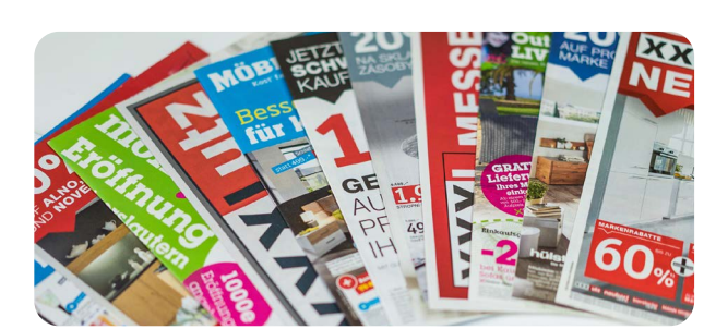
Tailor-made software solutions for flyer production

The detailed planning of publications is now supported in the campaign management solution and, where possible, executed automatically. With sophisticated rights and role management, user capabilities were defined within the solution. The solution met the goal of establishing an efficient and error-free production process. Ensuring consistency and reliability of media assets has given them a huge advantage. Premedia's solution is now used to produce countless other publications such as mailings, advertisements, pricebooks, packaging and more.